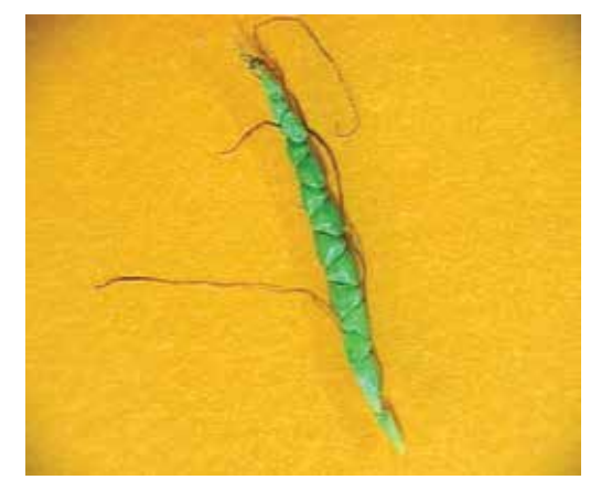
An ear of wild corn (teosinte) looks nothing like an ear of domesticated CORN.

earliest agricultural settlements appeared about 10,000 to 13,000 years ago. Proto-farmers collected the seeds of edible wild plants and planted them in managed fields in the first attempts at agriculture (Hancock, 2012). It probably did not take long for these would-be farmers to notice that some plants were more desirable than others. They would have harvested seeds from the plants with the most edible portions, which produced higher yields, or tasted better, and saved them to plant the next season.