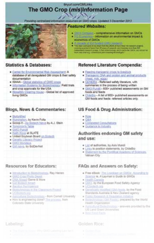
The website at www.tinyurl.com/GMLinks is a comprehensive resource for background information on genetically modified crops.

(Kuiper et al., 2013; Bartholomaeus et al., 2013; Van Eenennaam, 2013). Reports claiming that exposure of isolated cells suffered harmful effects when exposed to a chemical or a protein associated with a GM crop also have become increasingly common. Just about anything that is added to a cell in a Petri dish can have negative consequences, particularly if there is no way that cell could ever be exposed to that substance if it was in its normal place inside the body. In fact, many common food ingredients are toxic in these in vitro systems.